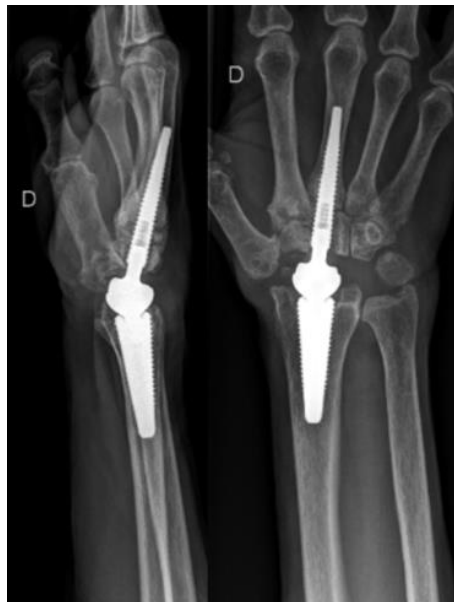
Lateral and AP X-rays Motec, 3 weeks post-TWA implantation

She experienced pain relief, improved range of motion, and enhanced grip strength at her two-year follow-up prior to the injury.