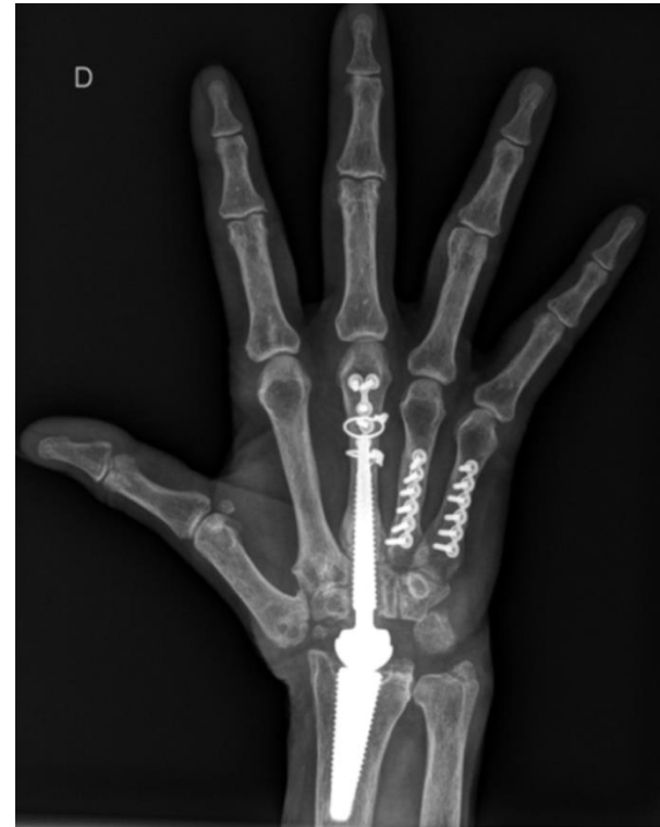
Postoperative AP radiographs of the 3rd, 4th and 5th metacarpal fracture secured with plates Internal fixation of the third metacarpal was limited by the restricted space available due to the stem prosthesis.

Immediate rehabilitation was initiated, with buddy taping and a four-week protective wrist-free splint followed by a two-week night splint.