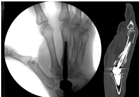
Fluoroscopic AP image and sagittal CT-scan showing metacarpal fractures (2 years post-TWA implantation)

The fracture on the third metacarpal was aligned with the distal end of the stem.